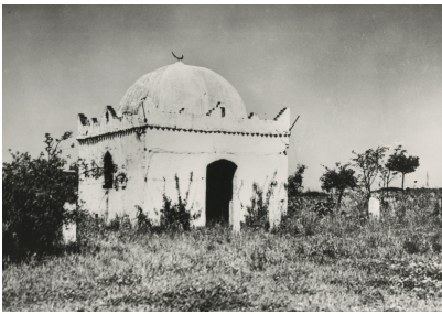
A mosque for the Moroccan soldiers of the French occupying forces