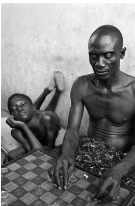
Robert Lebeck, Ashanti-Mann mit seinem Sohn beim Brettspiel, Ghana 1960