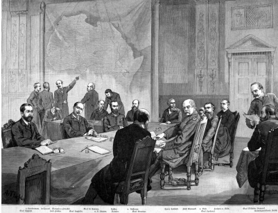
Drawing of the participants of the Berlin Conference, 1884

Source: Allgemeine Illustrierte Zeitung, Adalbert von Rößler (+1922)