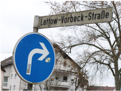
Lettow-Vorbeck-Straße in Völklingen

A street in Völklingen is named after the Saarlouis-born colonial military officer Paul von Lettow-Vorbeck (1870-1964), who was involved in the genocide of tens of thousands of Herero and Nama in Deutsch-Südwestafrika from 1904.