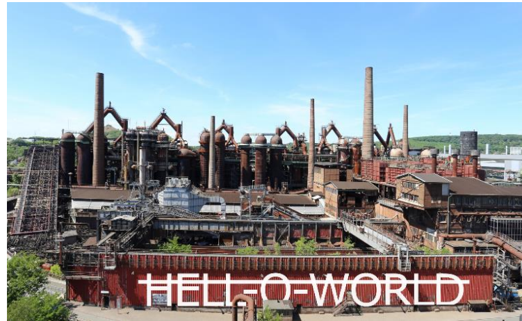
Dimensions: 6 x 78 m